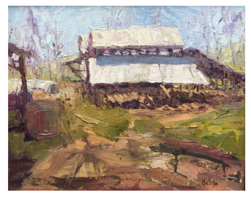
Barns 2016, oil, 14 x 18 in. Collection the artist Plein air