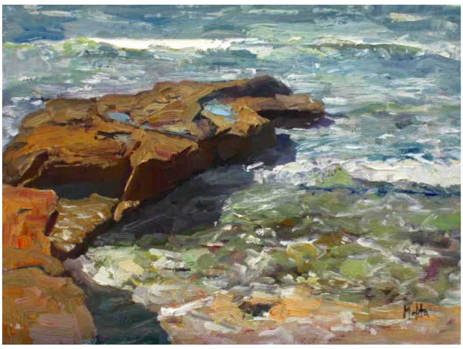
Rocks and Reef 2015, oil, 12 x 16 in. Collection the artist Plein air

visitors such as Vasari's video blue and pale yellow that actually work as warm and cool whites."