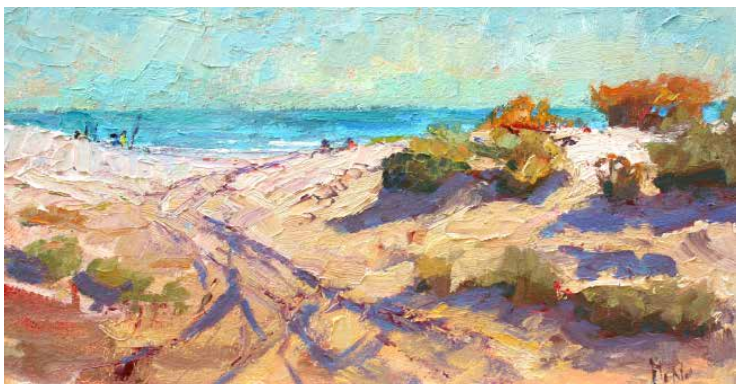
Fishing at the Sea 2015, oil, 8 x 16 in. Collection the artist Plein air

into the lights and, vice versa, the lights into the darks. That helps me maintain the important value and color relationships that will make the painting successful no matter how thick the oils may become.