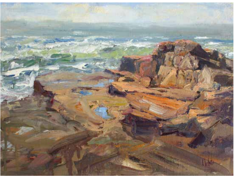
Maine Coast 2016, oil, 12 x 16 in. Collection the artist Plein air

Individual strokes of paint are allowed to blend on the painting, but Mehta avoids brushing the paints so much that they lose their natural luminosity and clarity. "I leave the strokes alone unless they are distracting," she says. "I try not to work on top of other strokes and, instead, work around the edges of the painted shapes to avoid making the colors muddy." Once the artist has finished a painting, she scrapes