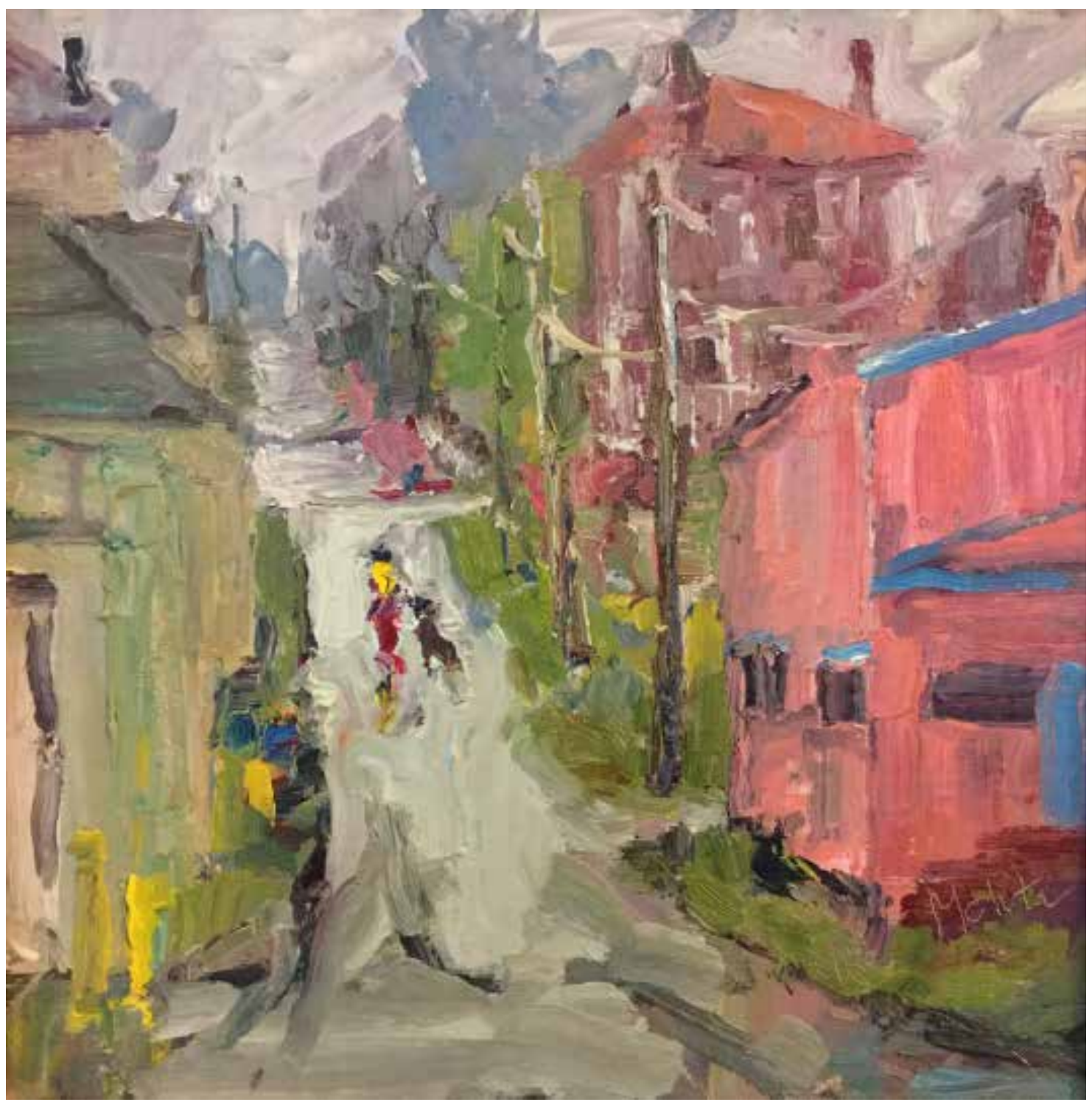
Rainy Day Alleyway 2016, oil, 12 x 12 in. Collection the artist Plein air