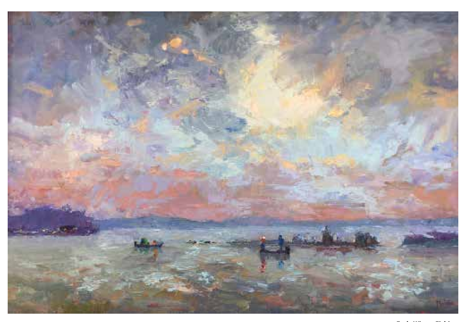
Early Winter Fishing 2016, oil, 26 x 36 in. Collection the artist Plein air